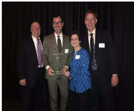
PEC staff accepts its Achievement Award at the Water Resources Association of the Delaware River Basin Recognition Dinner.